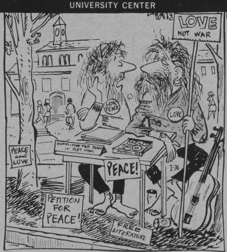
BUT WHEN YOU HAVE TO INTERVIEW WITH YOUR DRAFT BOARD WHY DONCHA JUST TRY TO BE RUDE AND BELLIGERENT - MAYBE THEY'LL CLASSIFY YOU AS AN UNDESIRABLE."