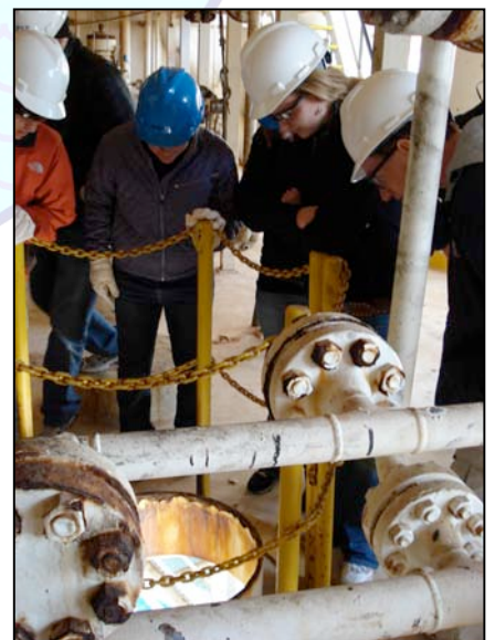
ES 2 honors section at Platform Irene.