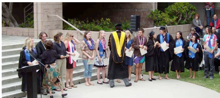
2007 ES Outstanding Achievement Award Recipients